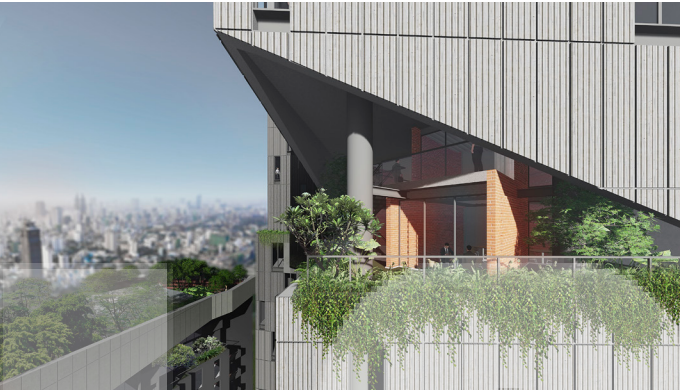
DIRECT ACCESS TO SKY VILLAGE 1, COURTYARD, F&B AND RETAIL FROM THESE FLOORS