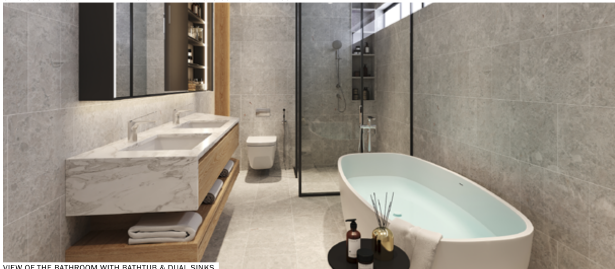
VIEW OF THE BATHROOM WITH BATHTUB & DUAL SINKS