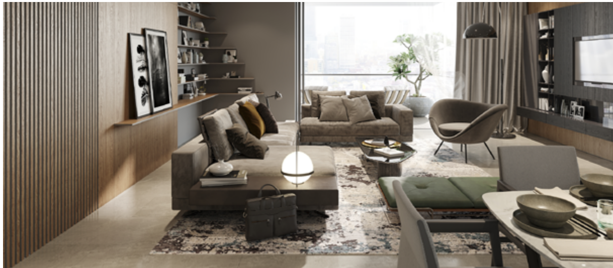
SPACIOUS LIVING AREA WITH VIEWS OF THE MEKONG IS SURE TO IMPRESS